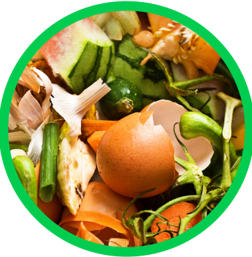
Food waste produced by premises producing more than 5kg of food waste a week

The nine specified recyclable waste materials that need to be separated for collection, collected separately, and kept separate after collection, in six separate recyclable waste streams, as a minimum, are as follows: