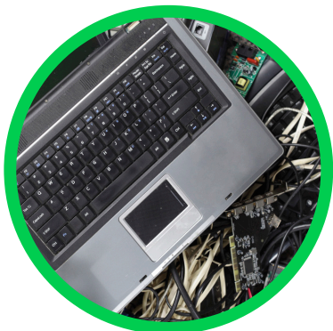
Unsold small Waste Electrical & Electronic Equipment (sWEEE)