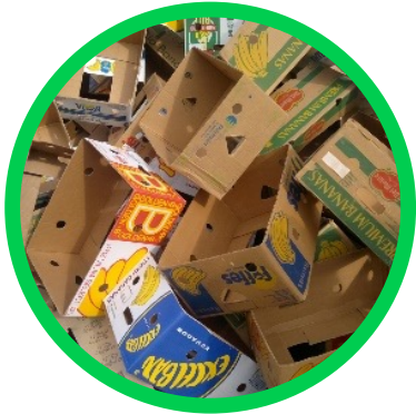
Paper & card