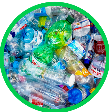
Metal, plastic, and cartons & other fibre-plastic composite packaging of a similar composition